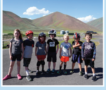
2<sup>nd</sup> Annual Pump Track Challenge, June