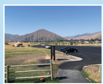
New paved entrance road and parking lot