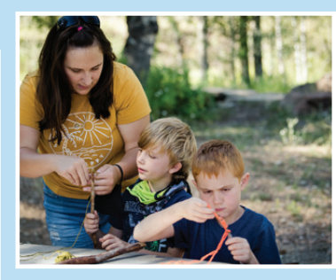
HUB After School Care and Summer Camp